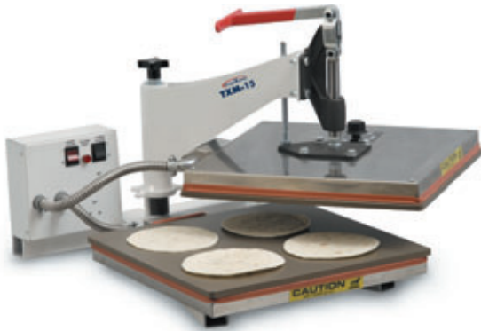
Shown with optional Xylan® non-stick coating

The efficient, economical, and durable TXM-15 is the 15 inch manual tortilla press with a swing away design for easy placement and removal of up to four tortillas. Works for either flour or corn tortillas, pizza dough and flat breads. Upper and lower platens heat to 450°F.