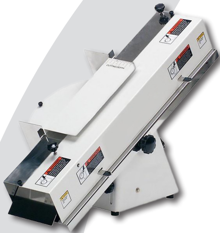
DXSM-270 (bread slicer)

The DXP-GF001 series bread slicer is a reliable, high-quality table top slicer that can be used for continuous operation. Great for use in Supermarkets, Bakeries, Schools, Deli's, Retail Bakeries, Sub Shops, Hospitals, Restaurants, Bagel Shops, Caterers, and more!