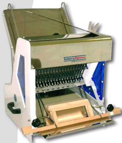
DXP-GF001 (gravity feed bread slicer)