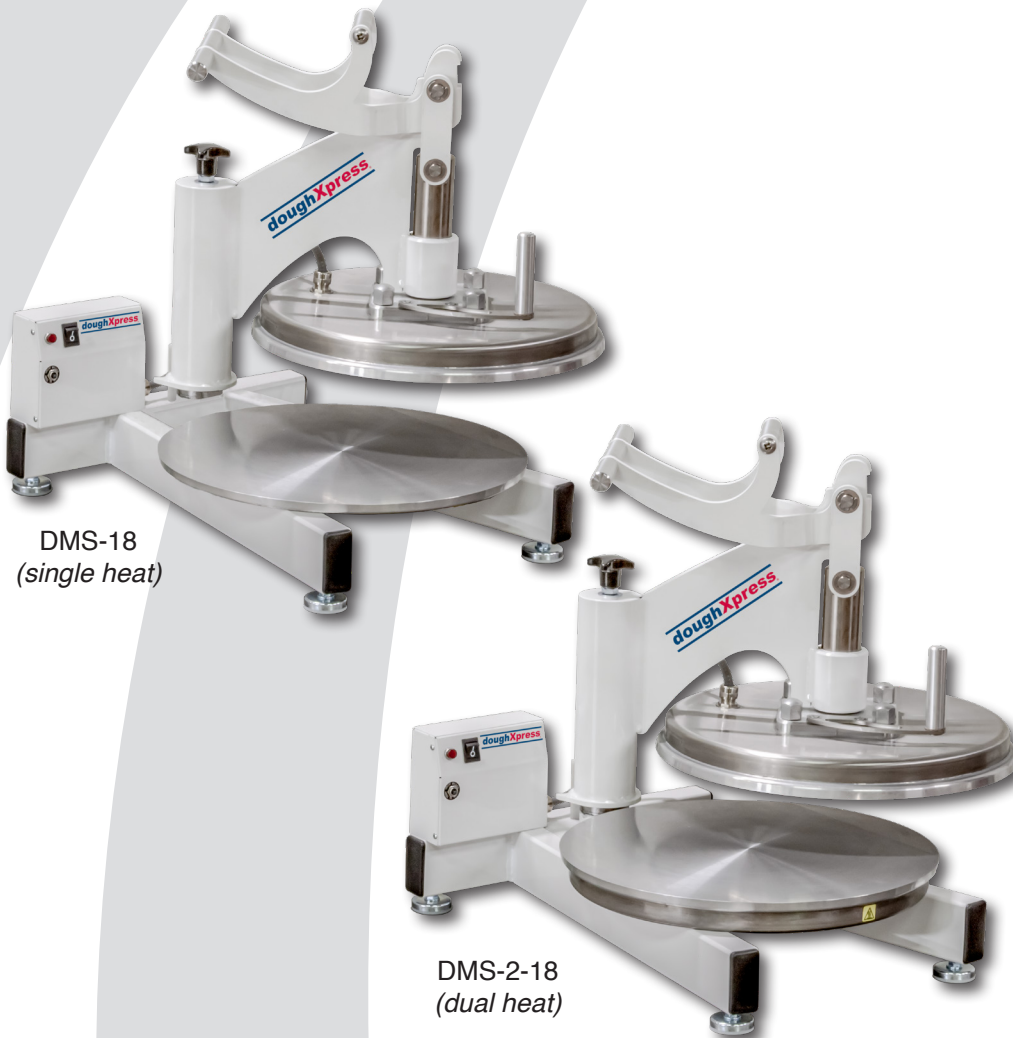
DMS-18 (single heat)

The DMS-2-18 is an economical manual swing away dual-heat dough press. These versatile dough presses can be used for pressing either pizza or tortilla dough. DoughXpress® recommends pairing this press with a DoughXpress® tortilla warmer to complete your tortilla production line.